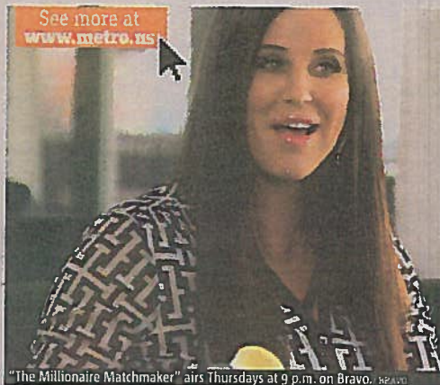
See more at www.metro.us

We have more opportunity to meet people we've never met before, internationally, not just in the United States. And it's big. But we're disposable at the same time. So, even