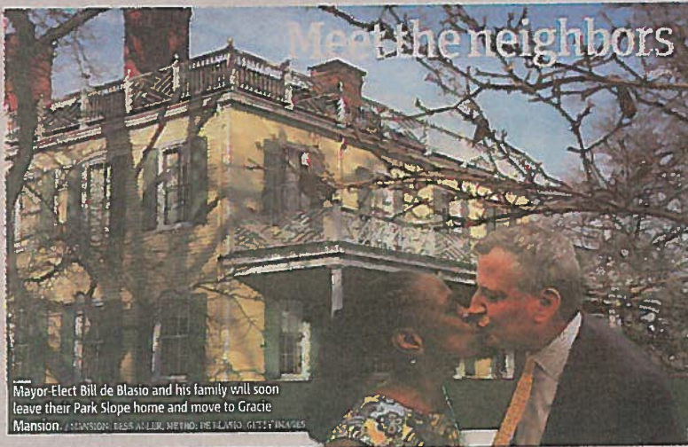
Mayor-Elect Bill de Blasio and his family will soon leave their Park Slope home and move to Gracie

Hop on board. The Straphangers Campaign released its annual list of the best and worst of the MTA over the past year. Still recovering. Superstorm Sandy casts a long shadow over the subway system with ongoing repairs to tracks due to the storm, as well as other flooding-related issues. PAGE 02