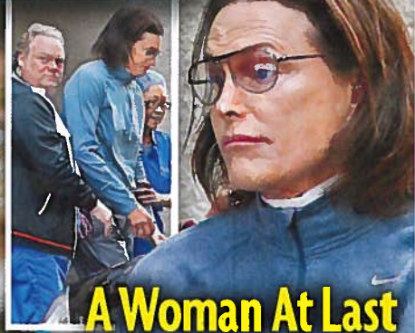
A Woman At Last