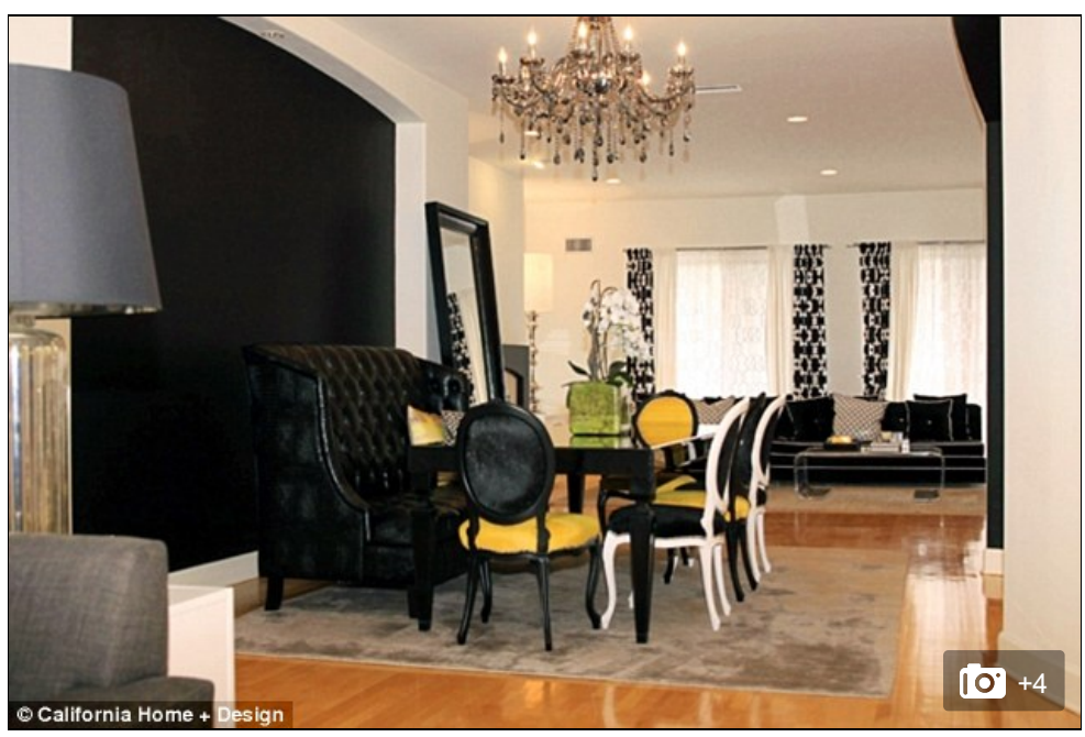
Who wants to be a millionaire? The designer added touches of bright yellow to the mainly black and white shades