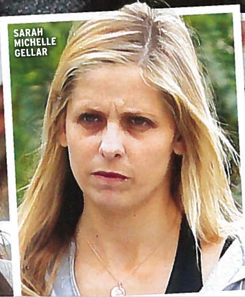
SARAH MICHELLE GELLAR