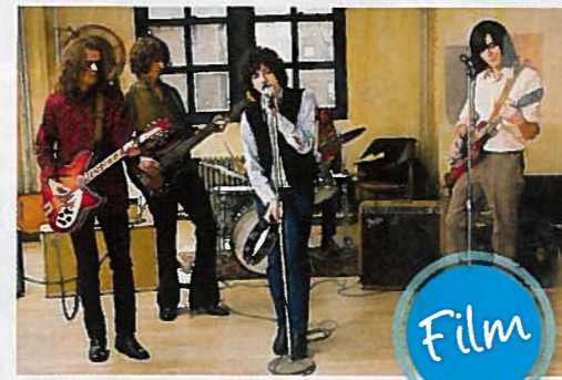
CLOCKWISE FROM BOTTOM RIGHT: HBO; WE TV; CINEMAX; BRAVO; ABC (2); ABC FAMILY; ABC; PARAMOUNT; FOCUS FEATURES; GETTY; LIONSGATE