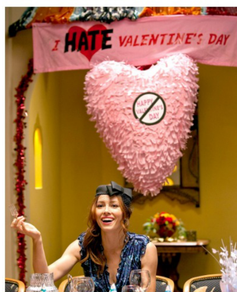
Jessica Biel in 'Valentine's Day'

Flowers and hearts and chocolates, oh my! It's Valentine's Day, the day when couples across America celebrate their love for each other in a very public manner.