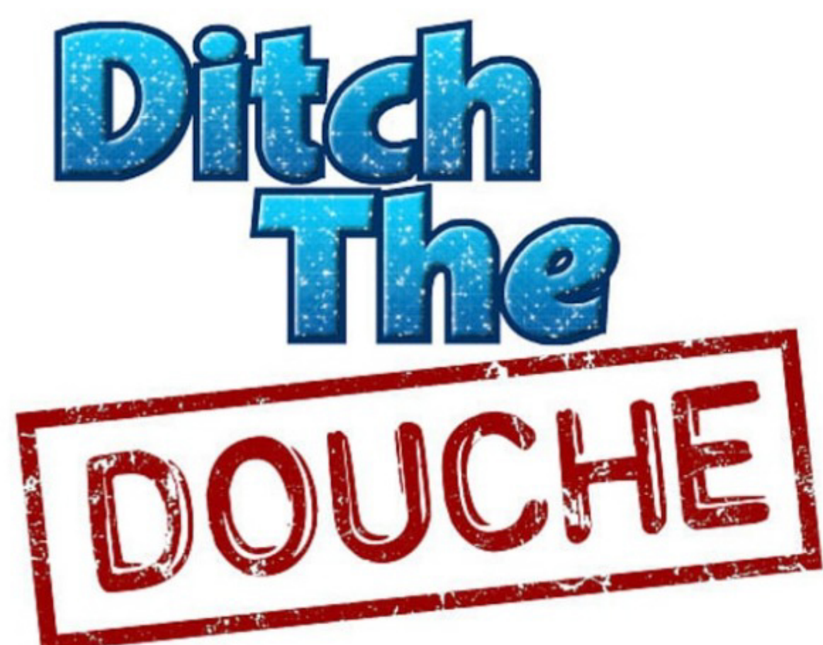
Ditch The Douche