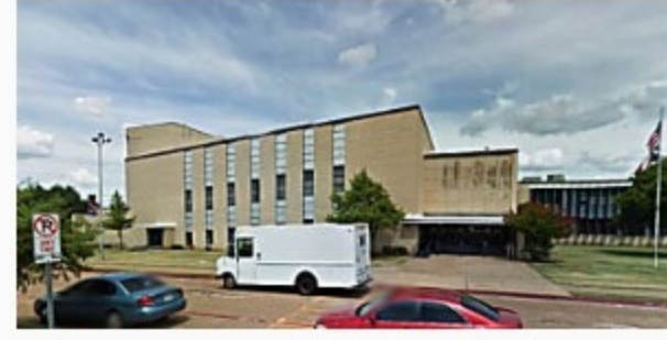
Teacher allegedly had sex with student who called her 'wifey'