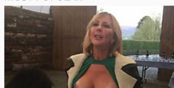
Vicki Gunvalson triggers FBI complaint for topless picture