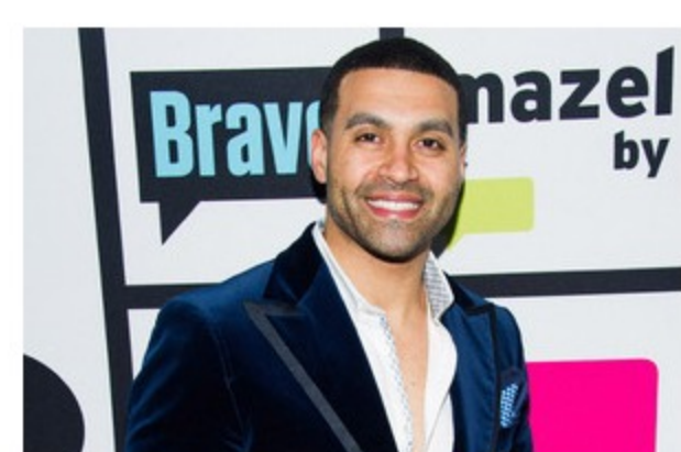
RHOA's Apollo Nida Gets Engaged While in Prison