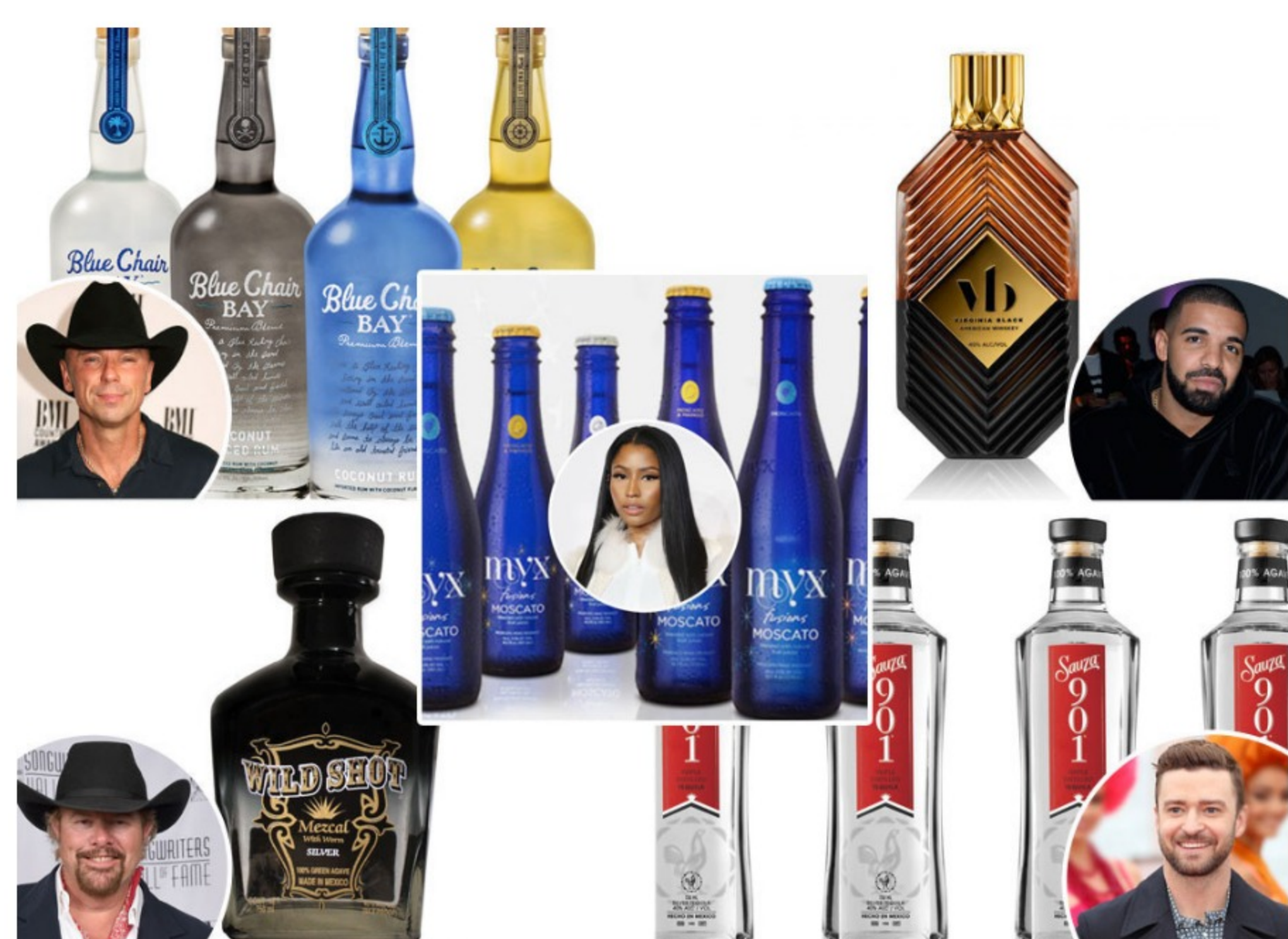
Getty, bluechairbayrum.com, wildshot.com, virginiablackwhiskey.com, sauza901.com, myxfusions.com