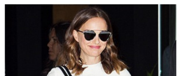
Love Her Outfit: Star Style to Steal