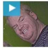
MOST WATCHED WATCH: Jim Gaffigan: 'Parenting Is All About Making Mistakes'