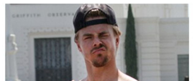
Derek Hough, Plus Claire Danes, Jennifer Lopez, Diane Kruger & More!