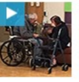
Elderly woman from movie