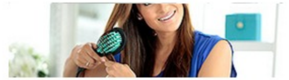
WATCH AND SHOP: Forget Your Flat Iron! This Brush Delivers Sleek Strands Instantly