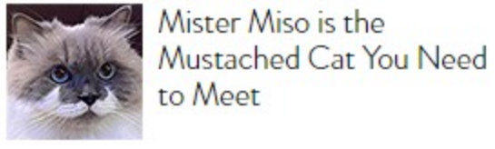
Mister Miso is the Mustached Cat You Need to Meet