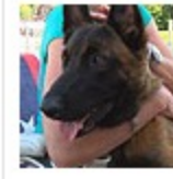
Overboard Dog Swims Miles, Walks Many More, Before a Facebook Post Helps Find Her