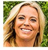
PEOPLE PREMIUM Read the Cover Story: The Gosselins 10 Years Later: 'So Much Has Changed' 🔑