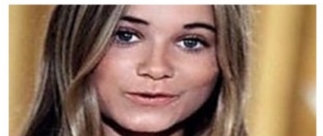
SPONSORED BY BREAKASTORY What Marcia Brady Looks Like Now Is Jaw-Dropping