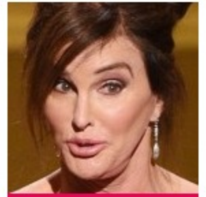
The Real Reason Why Caitlyn Jenner's Fame Has Faded