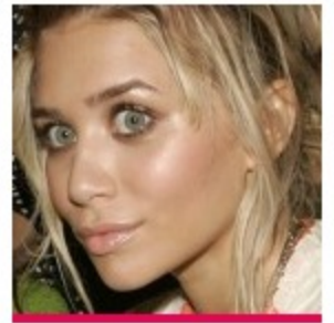
Sketchy Things Everyone Just Ignores About The Olsen Twins