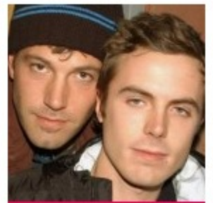
Sketchy Things Everyone Just Ignores About Ben & Casey Affleck