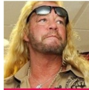
8 Scandals That Destroyed Public Images Forever