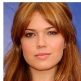
The Real Reason You Never Hear From Mandy Moore Anymore