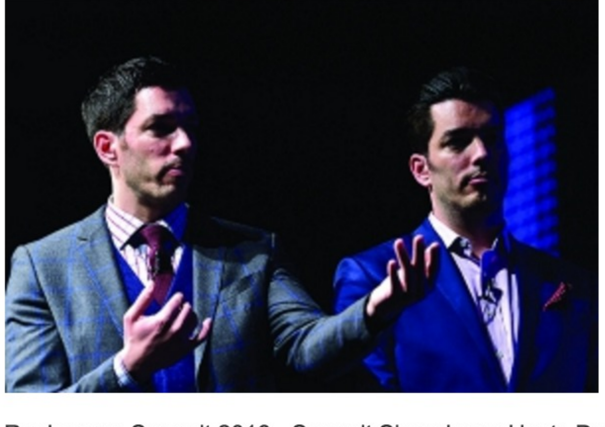
Realscreen Summit 2016 - Summit Showdown: Hosts Drew and Jonathan Scott